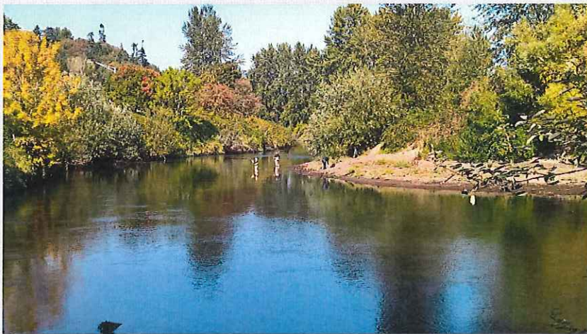
Left: People fishing immediately downstream of the contaminated Gilliam Creek outfall to the Green River.