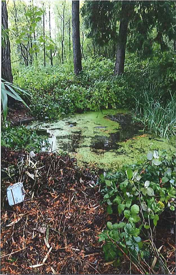
Above: District contaminated sampling site located. The pond is located on private property in NW corner of The Loop project. Effluent is to Gilliam Creek on 42nd Ave S.